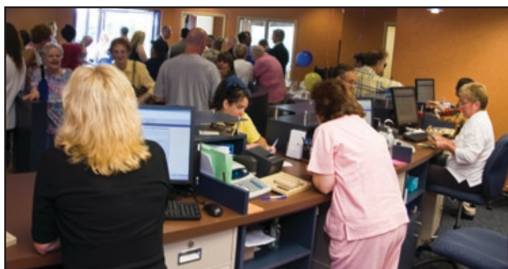
During our Grand Opening, the lobby was bustling all day! There are a lot of familiar faces in this picture. Do you see anyone you know?

It Was Great To See So Many Of You – Thank You For Joining Us!